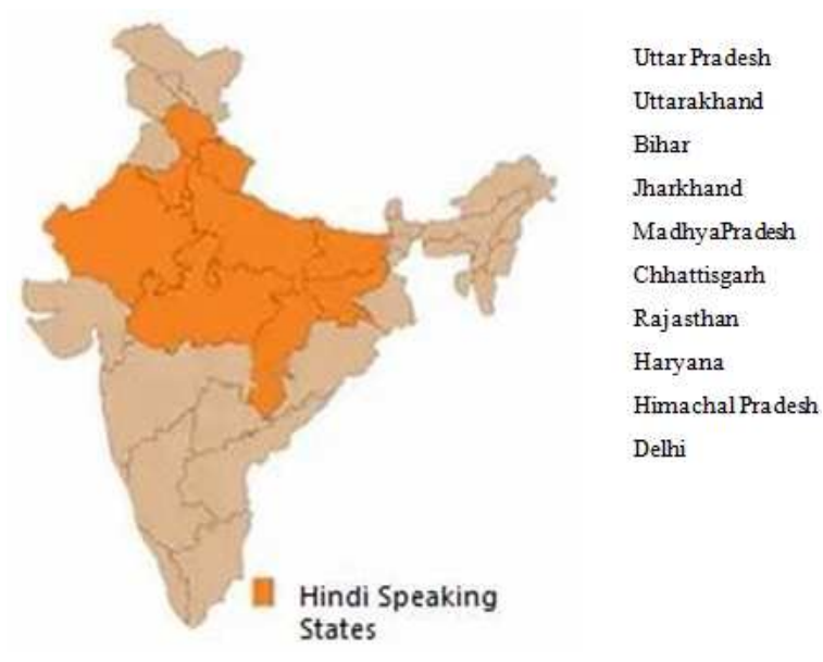
Figure 2: Hindi Speaking States of India.

In Figure-2, nine (9) states coming under the Hindi-speaking States-Uttar Pradesh, Uttarakhand, Bihar, Jharkhand, Madhya Pradesh, Chhattisgarh, Rajasthan, Haryana, and Himachal Pradesh, and one (1) Union Territory (National Capital Territory) of Delhi have been shown.